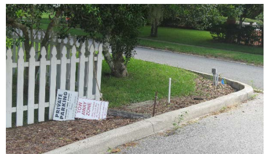
Various parking conditions and signage